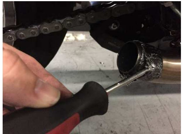
Use screwdriver to loosen.