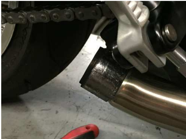
Gasket stuck to header?