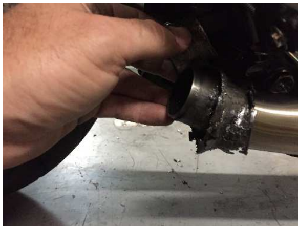
Unwrap broken gasket and remove.