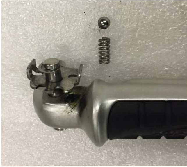
Passenger Foot Peg Assembly